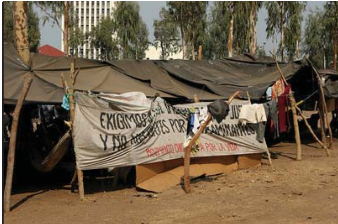
Banana workers encampment

In other news, Nicaragua suspended diplomatic relations with Israel after its attack in international waters on the Liberty Humanitarian Flotilla carrying humanitarian aid to Gaza resulted in the killing of 9