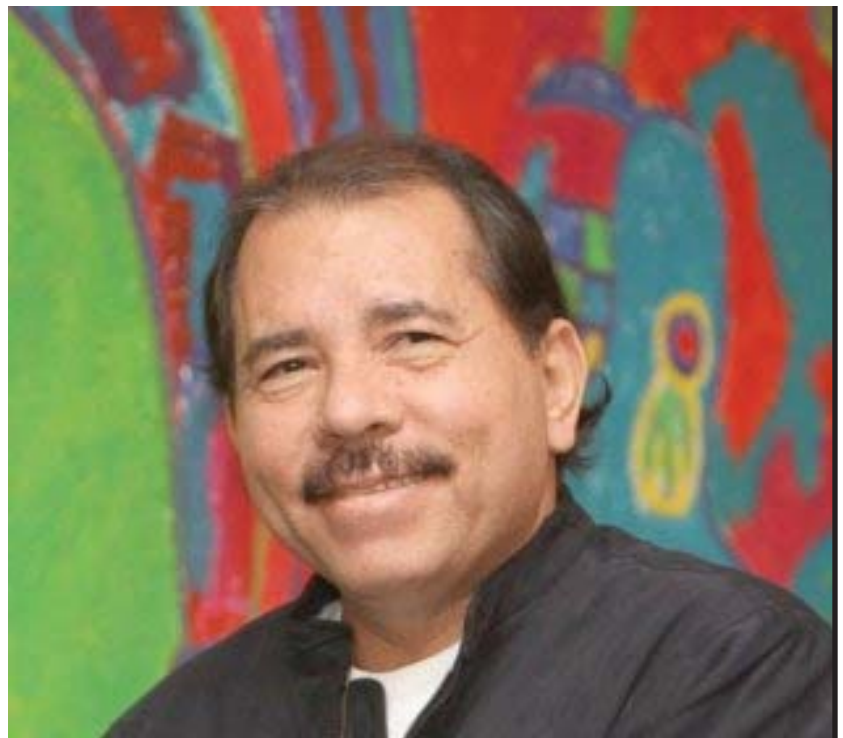
President Daniel Ortega

More than half a million people came out to a Managua plaza on July 19th to celebrate the 31st anniversary of the Sandinista revolution. In his speech, President Daniel Ortega reviewed the achievements of his government for the past three years, saying that levels of illiteracy in urban areas had been lowered to 4% and in rural areas to 8%. He noted that Nicaragua had the smallest decline in economic growth between 2008 and 2009 of any country in Central America and predicted the economy would grow in 2010. He said that 300,000 Nicaraguan farmers and ranchers were actively producing, noting that the production of corn had risen 22.6%, beans 18.5% and rice 17%. He stated that his government had built 400 miles of new highways, and maintained and repaired thousands of miles of roads and streets. Dissident Sandinistas held a celebration in Masaya on July 17.