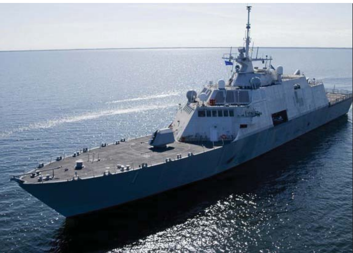
The combat ship “USS Freedom” conducts counter-trafficking operations in the U.S. 4th Fleet region.

In a controversial decision that is likely to fan the flames of regional tensions in Latin America, Costa Rica recently granted the US permission to move 7,000 troops and 46 warships (along with their accompanying planes and helicopters) into Costa Rican waters. Officially, the act is considered to be part of the “Drug War,” which appears to be increasingly more war-like in nature due to such actions and mounting violence in Mexico and Colombia. Costa Rica’s neighbors, however, see the massive military presence as a potential base for regional strikes. The increase is of particular concern, as Costa Rica has a long-standing pacifist tradition.