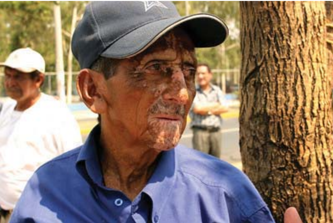
Nicaraguan banana worker who survived the effects of Nemagon.

The long quest for justice by banana workers poisoned by the pesticide Nemagon suffered further set-backs